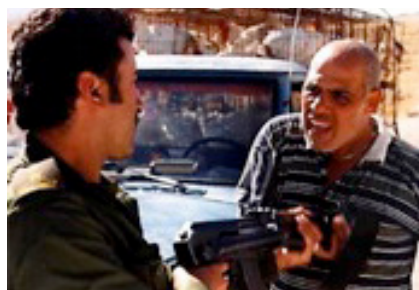
Cock Fight Sigalit Liphshitz Israel, 2000, 13 min. 40 sec.

http://vimeo.com/3063647 https://myspace.com/naomilevari/video/draft/13320381 https://www.youtube.com/watch?v=xteg6BpaGZE#t=219 (activate subtitles option)